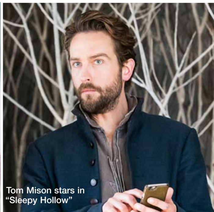
Tom Mison stars in “Sleepy Hollow”