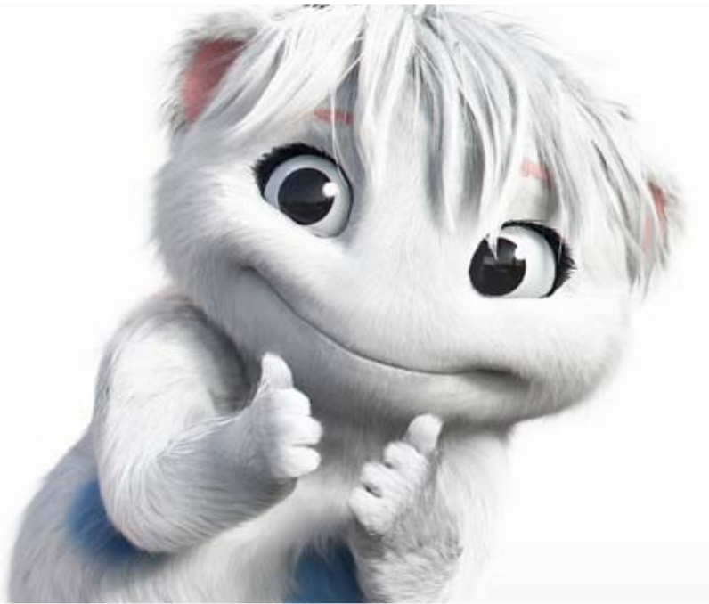
"Imaginary Mary" premieres