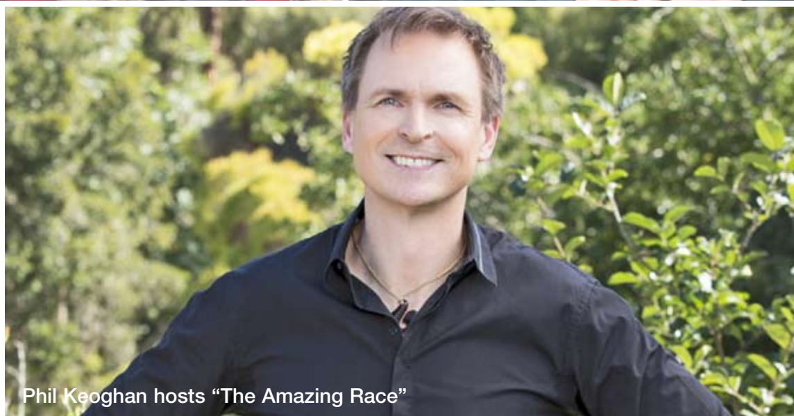
Phil Keoghan hosts “The Amazing Race”