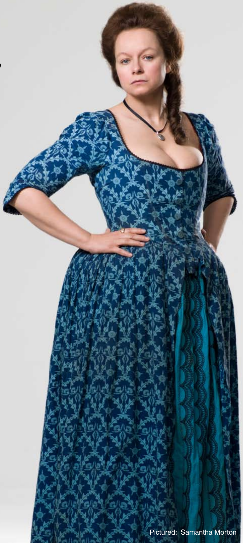
Pictured: Samantha Morton

"And nobody was moralizing about it," she continues. "It was very open. It was a very sexually open society. It was brazen and, yeah, you could be walking around Soho and see people having sex in an alley. It wouldn't be unusual."