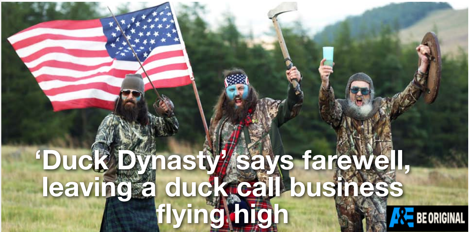
Pictured: Jep, Willie and Si Robertson (from left)