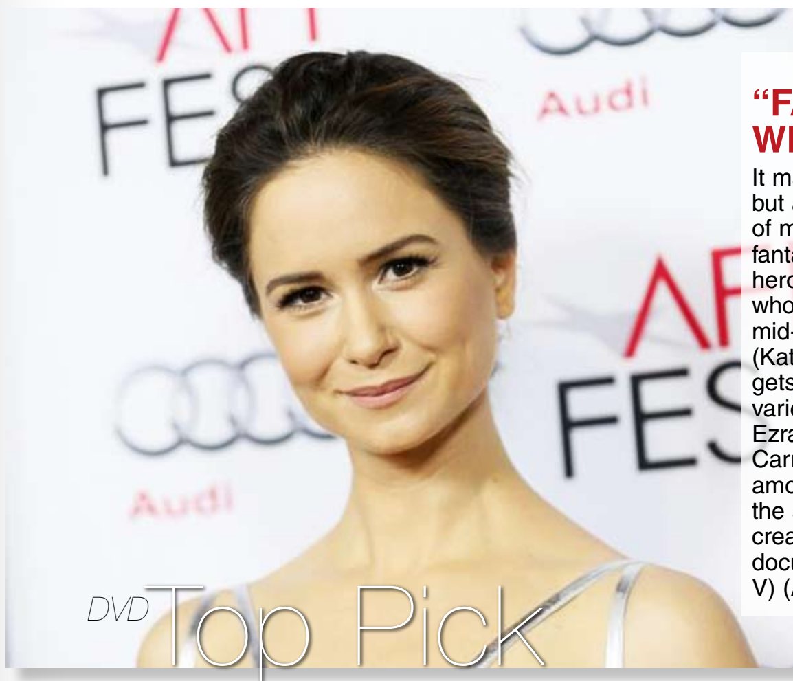
Pictured: Katherine Waterston