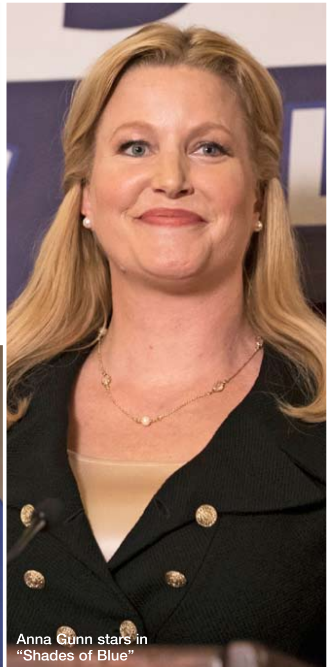
Anna Gunn stars in "Shades of Blue"