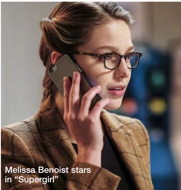
Melissa Benoist stars in "Supergirl"