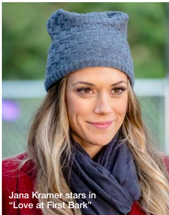
Jana Kramer stars in “Love at First Bark”